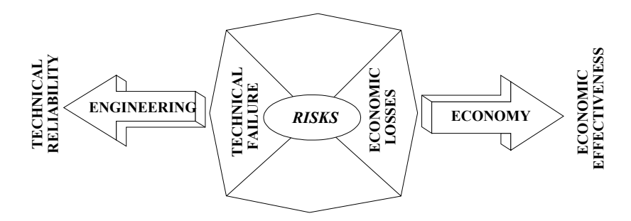
Figure 1: Technical and economic objectives.